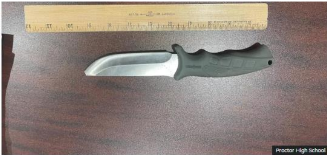
Knife used in stabbing

88. The May 23 BBC Article further stated: